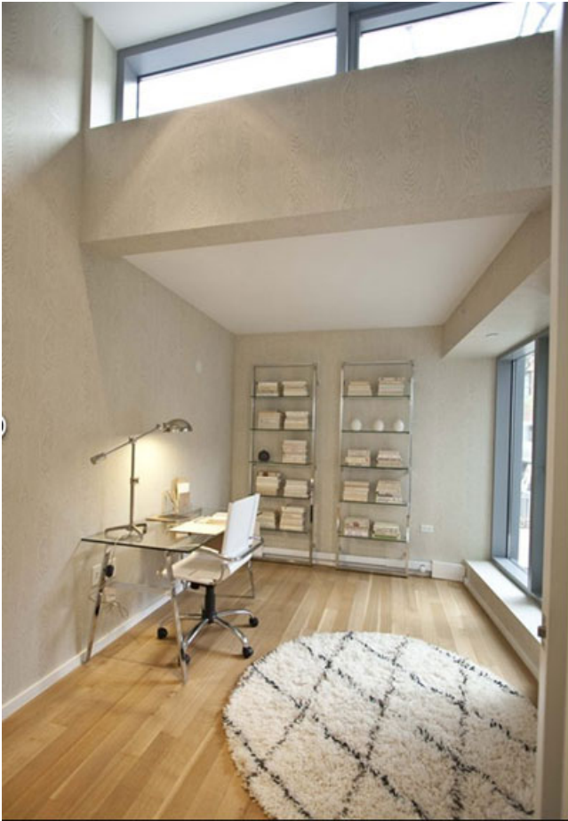
There's also a skylight in this room.