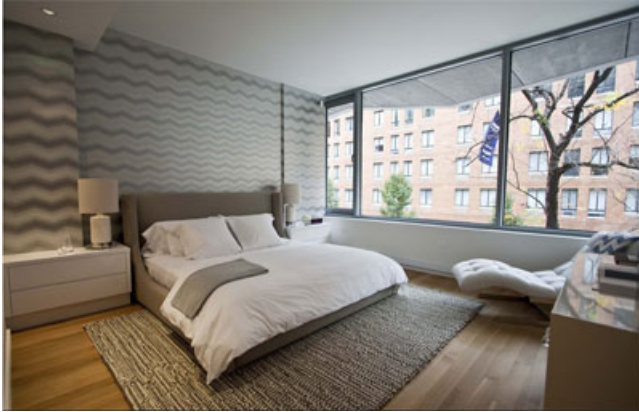
Upstairs, the master bedroom.