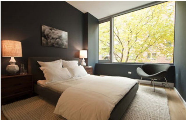
A second bedroom. In this case, the low furniture isn't a design trick to disguise low ceilings.