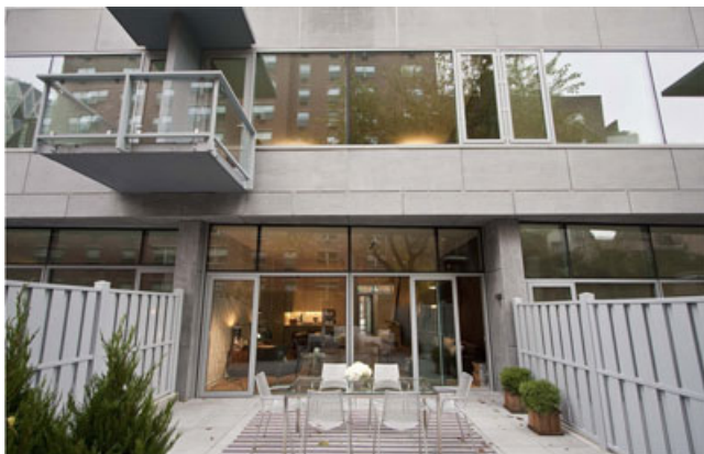
The townhouse also includes the floor above.