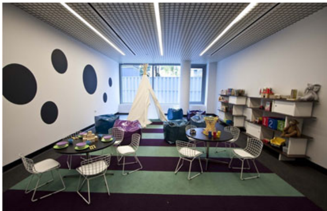
On the lobby level of the main building.

During our recent sales update on Hell's Kitchen's The Dillon , we mentioned the building's townhouses, nine triplexes that recently hit the market. Building reps invited us over for a tour of townhouse 413, designed by Haus Interior, and the recently-completed building amenities (lounge, dining room, playroom, fitness center). Pricing for these newbies—one of which has already been sold, according to reps—starts at $3.165 million, though TH413 is asking a little more at $4.15 million. Is what's behind that folded glass curtain wall worth the price? Developer SDS Procida is "confident the rest will sell quickly," and this is, of course, a building known for its modesty.