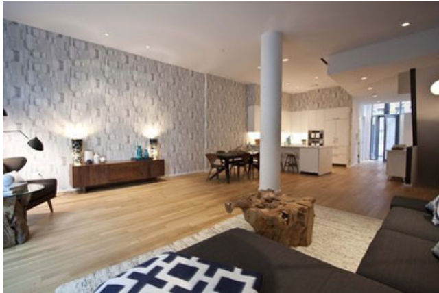
Looking back into the great room from the doors outside.